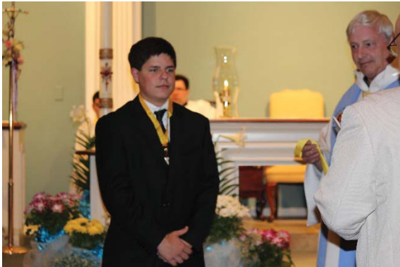
DEPUTY CHIEF SQUIRE