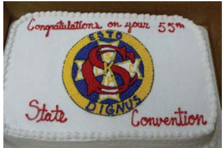
A PICTURE IS WORTH A 1,000 WORDS & TASTED GOOD TOO