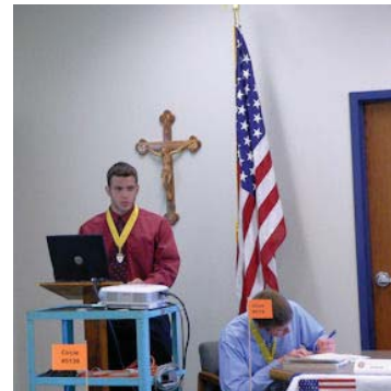
Squire Circle 5138 report