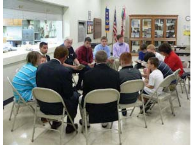
Father leading Prayer Service