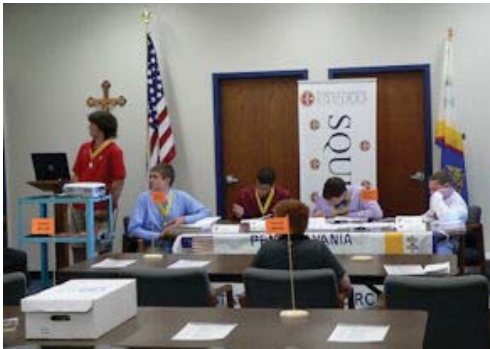
Squire Circle 5250 report