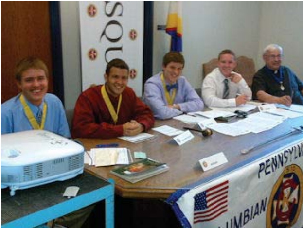
STATE OFFICERS OPENING MEETING