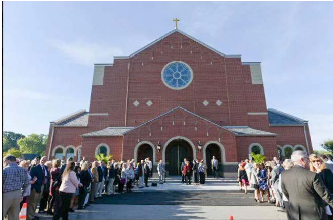
Saint Alexis Church Dedication October 22, 2017