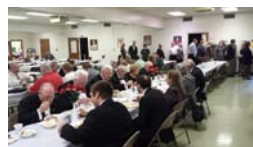
Luncheon Crowd at Memorial Mass