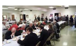
Luncheon Crowd at Memorial Mass